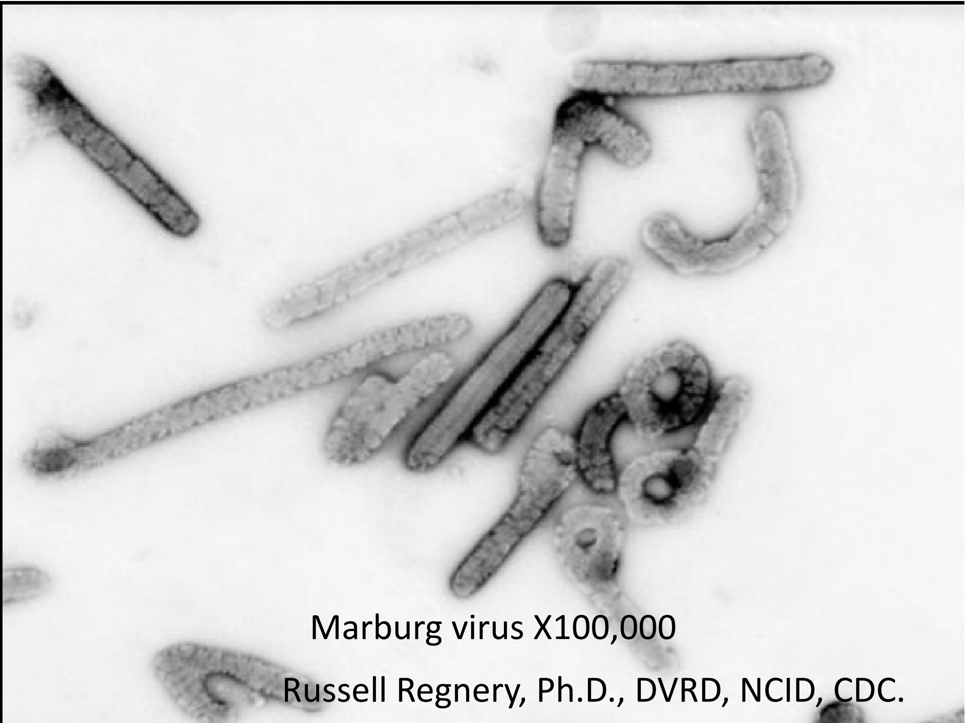
Marburg virus X100,000